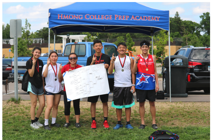
HCPA School Picnic 2018

HCPA is bringing back our annual school picnic to end the school year with our staff and students. All immediate families are invited to join us on June 3rd from 8:30AM to 2PM. More information will be sent home soon. You can contact the main office and ask to speak with anyone from the events planning committee for any questions.