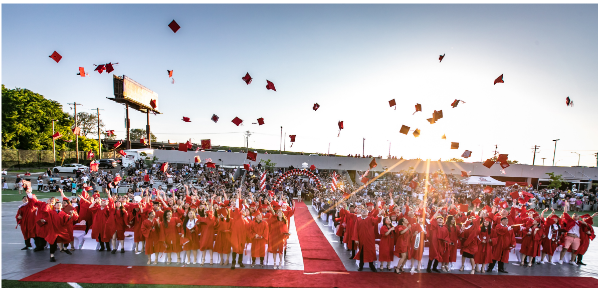
HCPA Class of 2019