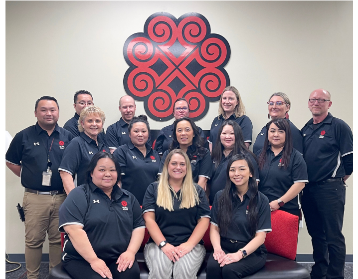
HCPA Advancement Team

HCPA's Advancement Team meets on an ongoing basis to discuss the school's process and procedures, ways HCPA can bring our mission and vision to life for our school and community, and strategically collaborating to provide the best educational experiences for our students and families. We look forward to continuing our partnership with our staff, students and families as we work towards the advancement and future of HCPA.